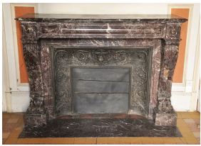
Antique Napoléon III style fireplace made out of red Levanto marble during the 19th century.