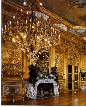
Picture 1 : The grand fireplace in the Marble House is framed with low-reliefs in gilded wood by Louis Ardisson.