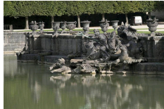
Picture 14 : Adam Lambert Sigisbert (1700-1759), Neptune with his trident, Amphitrite receiving the riches of the sea from a naiad on the marine chariot accompanied by Tritons and sea monsters, 1736-1740, monumental lead sculpture, 4,5 x 7,4 m (14.8 x 24.3 ft), Château de Versailles.