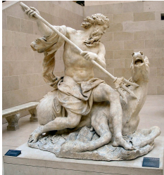
Picture 13 : Antoine Coysevox (1640-1720), Neptune, 1705, marble, 185.5 x 117 x 111 cm (73 x 46 x 43.7 "). Paris, Louvre (originally in the Parc de Marly).