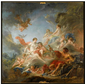
Picture 4 : François Boucher (1703-1770), Les Forges de Vulcain (Vulcan's Forges) or Vulcain présentant à Venus les armes pour Enée (Vulcan Presenting Venus with Arms for Aeneas), 1757, Louvre.