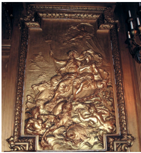
Picture 2 : Louis Ardisson depicted the Triumph of Neptune and Amphitrite. This work may be inspired by a ceiling by Charles Le Brun at the Louvre.