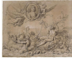
Picture 8 : Pierre Mignard (1612-1695), Neptune offre à Colbert la domination des mers (Neptune offers Colbert supremacy over the seas), black stone drawing with white highlights on beige paper, Louvre.