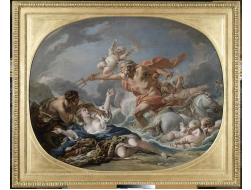
Picture 11 : François Boucher (1703-1770), Neptune poursuivant la nymphe Amydone (Neptune following the nymph Amydone), 1764, oil on canvas, Versailles, Château de Versailles et de Trianon.