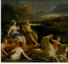
Picture 7 : BOULLOGNE the Elder (1649-1717), Neptune amenant Amphitrite dans un char marin (Neptune bringing Amphitrite in his marine chariot), 141 x 162 cm (55.5 x 63.8 ").