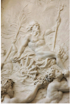
Picture 6 : Triumph of Neptune, low-relief in Statuario Carrara marble for the Berwind estate on Fifth Avenue, inaugurated in New York in 1894.

On the Berwind mantel , there is a decorative pattern of cherubs that symbolizes heat (photo 18). This iconography originates from allegories of Winter that were very common at the beginning of the eighteenth century (photo 17).