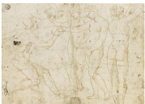
Studio of Raffaello, The Judgment of Paris, drawing, Louvre museum, Paris.

The subject of the Judgment of Paris has been one of the most important in history of arts, liked by elites who see a deep philosophical meaning in it, as well as the people touched by its universal message.