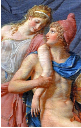
Jacques Louis David, The Loves of Pâris and Helen, 1788, a Neoclassic painting kept in the Louvre museum, detail.