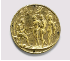
The Judgment of Paris, pattern by "master IO.F.F.", 16th century, gilded bronze, Louvre museum, Paris.