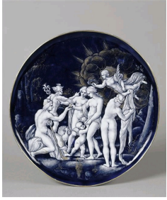
Leonard Limosin, The Judgment of Paris, 1562, Limoges, painted enamel, national museum of Renaissance, Ecouen.