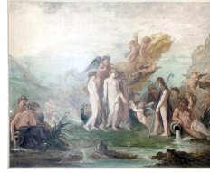
Gustave Moreau, The Judgment of Paris, 3rd quarter of 19th century, Gustave Moreau museum, Paris.