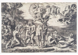
Marcantonio Raimondi, The Judgment of Paris, engraving after Raffaello, c. 1510-1515, 29,8 x 44,2 cm, Petit Palais museum, Paris.