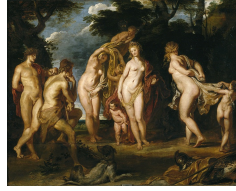
Peter Paul Rubens, The Judgment of Paris, 1638-1639, Prado national museum, Madrid.