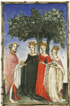
Christine de Pisan, The Epistle of Othea, c. 1415, Bibliothèque nationale de France, Paris.