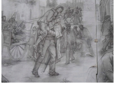
Sketch by Charles Crauk for the stained glass window exhibited with Charles Lorin in 1894.