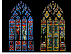
Stained glass windows of 1959, showing : to the left, Saint-Jeanne of France and Saint-Genevieve ; to the right Saint-Yves and the Ars Bishop. Saint-Leonard Church, Fougères.