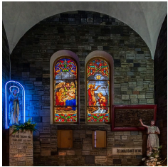
Maison Lorin, Stained glass of the Chapel in Notre-Dame Cathedral in Saigon, Hô-Chi-Minh-City, Vietnam