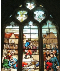
Stained glass window exhibited in 1894 in the Exposition of Arts applied to Industry.