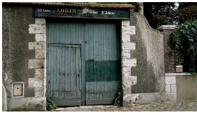
The Maison Lorin's doorway, 46 rue de la Tannerie, in Chartres, historical monument since 1999.