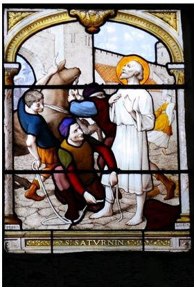
Maison Lorin, Saint-Saturnius, 1894, listed historical monument, Saint-Aignan Church, in Chartres.