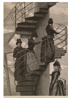
The ascent of the Eiffel Tower by the stairs.