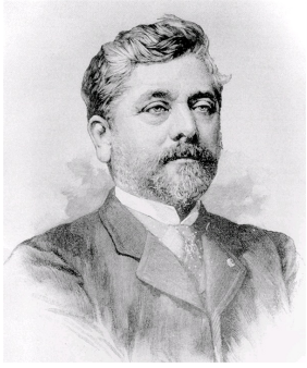
Portrait of Gustave Eiffel in 1893 published in L'illustration.