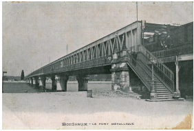
The Passerelle Eiffel crossing the Garonne river in Bordeaux, 1858-1860.