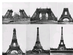
Stages of the construction of the Eiffel Tower for the Universal Exhibition of 1889 in Paris.