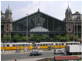
The Budapest-Nyugati train station in Hungary built by Eiffel in 1875.