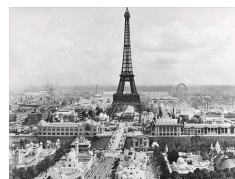
A bird's eye view of the Eiffel Tower at the Universal Exhibition of 1889 in Paris.