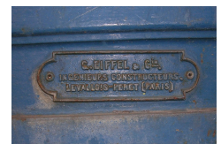
Signature of « G. Eiffel et Cie ».

Gustave Eiffel was born in Dijon in 1832 and died in 1923.