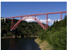
The Viaduct of Garabit in Cantal. Technical feat of Gustave Eiffel in 1884.