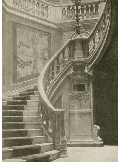
The large Onyx staircase, hôtel de la Marquise de la Paiva, Paris.