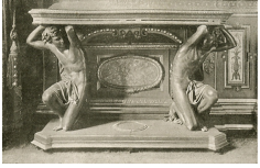
Atlantes shaped console from the Marquise de Paiva hotel, kept today at the musée d'Orsay in Paris.