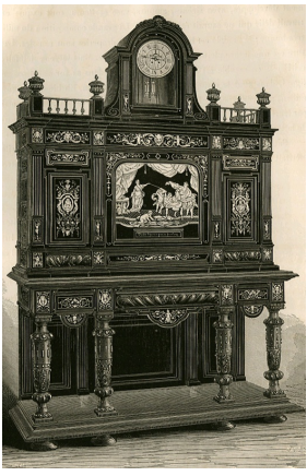
Piece of ebony furniture, encrusted in ivory, Renaissance style, by Hunsinger, World's Fair of 1867.