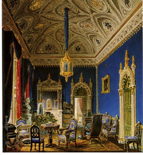
Neo-Gothic style living-room project, watercolour, c.1836. Neo-gothic style permeated everything from furniture, to mirrors, to the mantelpiece...