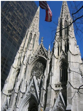
Neo-Gothic facade of Saint-Patrick's Cathedral, New York, 1885-1888, James Renwick Jr.