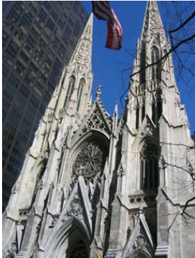
Neo-Gothic facade of Saint-Patrick's Cathedral, New York, 1885-1888, James Renwick Jr.