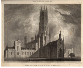
Front of Fonthill Abbey, England.