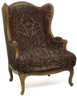
"Bergère" chair with wings, beech, original stuffing. Decorative Arts Museum, inv. 5408 ; ©photo Les Arts Décoratifs.

In 1830, the Rococo style fascinates Théophile Gautier, a major critique, who advocates its fantasy and playfulness. In 19th century , numerous mansions and castles provide themselves with Regence furniture, thanks to 19th century fabrication of furniture and bronzes by Beurdeley and H. Dasson.