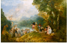
Antoine Watteau, Pilgrimage to the Isle of Cythera, 1717, Louvre museum.