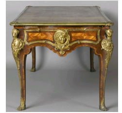
Flat desk by Charles Cressent, side view. One can admire the two "espagnolettes" and the marquetry work.