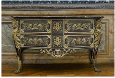
Chest of drawers "tombeau", in veneered ebony and gilded bronze, held in Château de Versailles. It displays two "espagnolettes" at the corners.