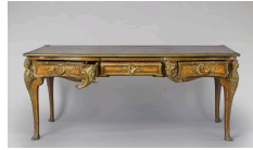
Flat desk by Charles Cressent, c. 1740, Louvre museum, inv. OA5521.