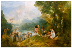
Antoine Watteau, Pilgrimage to the Isle of Cythera, 1717, Louvre museum.