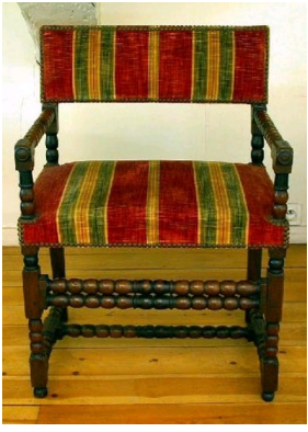
Louis XIII style armchair, first half of the 17th century, museum of decorative arts in Bordeaux.