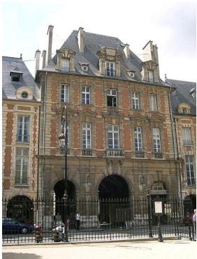
The king's residence at the Place des Vosges in Paris, built in 1608.