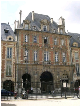
The king's residence at the Place des Vosges in Paris, built in 1608.