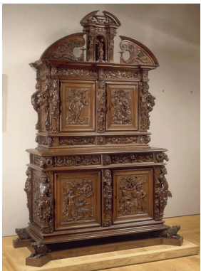
Double bodied cabinet, Louis XIII style, walnut wood, first quarter of the 17th century, Louvre Museum, Paris.