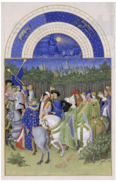
An illustration of "les très riches heures du duc de Berry".