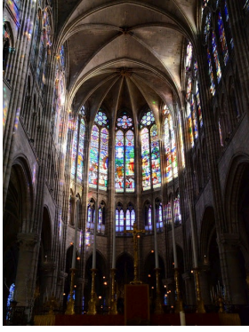
Interior of the Basilique de Saint-Denis made by Abbé Suger around 1135.