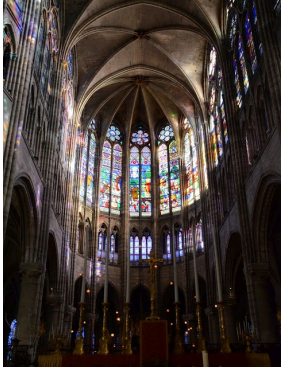
Interior of the Basilique de Saint-Denis made by Abbé Suger around 1135.