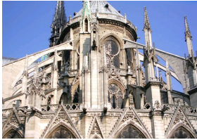
Exterior flying buttresses on the Cathedral of Notre-Dame in Paris built around 1163.