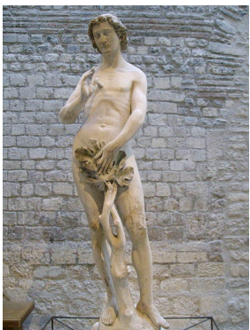
"Adam" statue that once Decorated the Notre-Dame in Paris, and is now kept at Cluny Museum.

Following the Roman style, the Gothic style covers a vast period from the 12th century to the 15th century. In France, this style started in the Ile de France region and then spread to the North of the Loire.