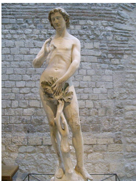
"Adam" statue that once Decorated the Notre-Dame in Paris, and is now kept at Cluny Museum.

Following the Roman style, the Gothic style covers a vast period from the 12th century to the 15th century. In France, this style started in the Ile de France region and then spread to the North of the Loire.