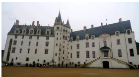
Duke of Brittany's castle in Nantes, made out of Tuffeau.