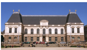
Parliament building of Brittany, in Rennes, made out of Tuffeau.