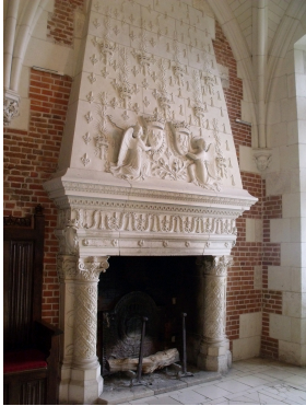
Monumental fireplace made out of Tuffeau in the Council Chamber in the Castle of Amboise.

During the gallo-roman period, Tuffeau was exploited from quarries in Anjou and Touraine for the use of buildings. Tuffeau was largely extracted from the 11th century to the 19th century, especially for the construction of large castles in the Loire during the Renaissance period.