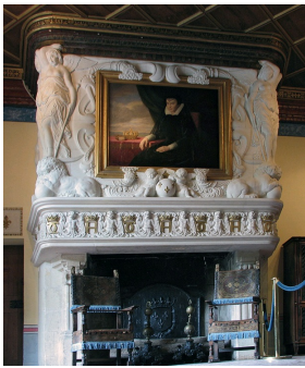
Exceptional fireplace made out of Tuffeau made by Jean Goujon for the bedroom of Diane de Poitiers at the castle of Chenonceau.

Tuffeau is impressive because of its visual aspects. Its appearance, which is not of a mineral appearance, is more of a smooth fabric than a rigid and cold material. It is made up of different shades of blonde and white. It has been used for various sculpted and carved ornaments on facades of buildings or in courtyards. Tuffeau also offers very practical qualities. Light, low-noise and frost-resistant, it deals well with slow changes in climatic conditions. Tuffeau has been used to construct a number of european monuments. Including the duke of Brittany's castle in Nantes , the parliament building in Rennes , the monument of Leopold the 1st in Brussels .