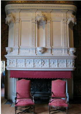
Monumental fireplace made out of Tuffeau decorating the bedroom of François the 1st in the castle of Chenonceau.