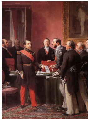
Adolphe Yvon, Napoléon III Giving Haussmann the Decree for the Annexation of Adjacent Towns to Paris on February 16th, 1859, 1865, Musée Carnavalet.

Inside these buildings, the interior design is also carefully planned. The beautiful marble fireplaces in the styles of Louis XV, Louis XIV or Louis XVI are called "cheminées haussmanniennes", or "Haussmann fireplaces".