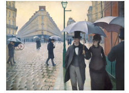
Gustave Caillebotte, Paris Street; Rainy Day, 1877, Art Institute of Chicago.