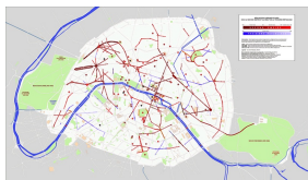
The Transformation of Paris during the Second Empire and at the Beginning of the Third Republic