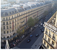
Boulevard Haussmann, lined with typical Haussmann buildings.