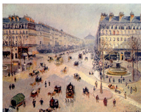
Camille Pissarro, Avenue de l'Opéra, 1898, Reims Museum of Fine Arts.