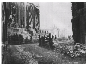
Construction of the avenue de l'Opéra.