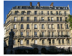
Haussmann building façade, place Saint Georges, Paris.