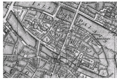
The medieval Île de la Cité before the Haussmann renovation (Vaugondy map, 1771).