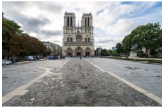
The Parvis de Notre-Dame, place Jean-Paul II.