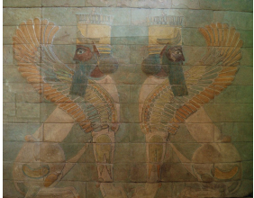
Decorative panel with symmetrical winged male sphinxes from the palace of Darius I at Susa, 522-486 BC, Louvre Museum, Paris.