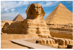
The Great Sphinx of Giza, Egypt, ca. 2558-2532 BC.