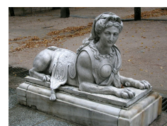
Sphinx, mid-18th century, La Granja, Spain. At the end of the 17th century, the sphinx became a common figure in European gardens.