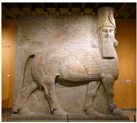
Lamassu, or human-headed winged bull, from Dur-Sharrukin, Neo-Assyrian Period, ca. 721-705 BC, University of Chicago Oriental Institute, Chicago.