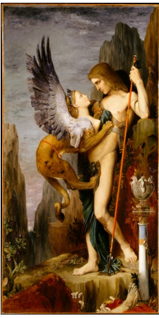
Oedipus and the Sphinx, Gustave Moreau, 1864, oil on canvas, Metropolitan Museum of Art, New York City.