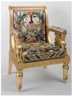
Armchair with Sphinx coming from the Queen bedroom, Chateau of Fontainebleau. 19Th century.