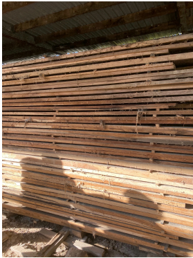
Lot of Okoumé wood for about 70m 3