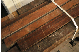
Linear mahogany parquet flooring from the 19th century

The mahogany wood was widely imported from America and especially from the Malabar islands but also Haiti, Cuba or Mexico. Nevertheless, the mahogany varieties the most popular come from Saint-Domingue (mahogany from Haiti) and Cuba.