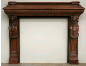
Antique mahogany mantel with lion heads, 19th century

It's only in the 1850's that the massive importation of mahogany restarts and lets it become a luxury material accessible to all and priced the same as the indigenous varieties.