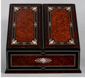
Maison SORMANI, Luxurious writing set in mahogany, ebony and ivory marquetry, circa 1875

In reality, the mahogany refers to tropical trees. We especially find them in South America and Central America, but also in the Antilles, where they belong to the Swietenia kind. We also find the mahogany on the African continent where it belongs to the Khaya kind. It is this type of mahogany that is mainly used for furniture making. As for the Asian mahoganies, it belongs to the Toona kind.