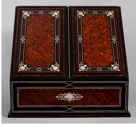
Maison SORMANI, Luxurious writing set in mahogany, ebony and ivory marquetry, circa 1875

In reality, the mahogany refers to tropical trees. We especially find them in South America and Central America, but also in the Antilles, where they belong to the Swietenia kind. We also find the mahogany on the African continent where it belongs to the Khaya kind. It is this type of mahogany that is mainly used for furniture making. As for the Asian mahoganies, it belongs to the Toona kind.