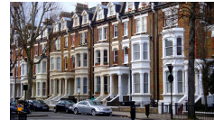
Victorian houses, London.