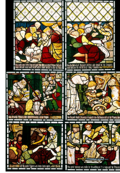
Stained-glass window representing the Saint George's legend, Dante Gabriel Rossetti for Morris, Marshall, Faulkner & Co., circa 1862, Victoria and Albert Museum.