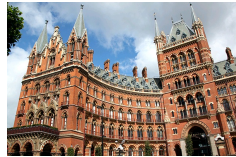
St Pancras Midland Grand Hotel, London.