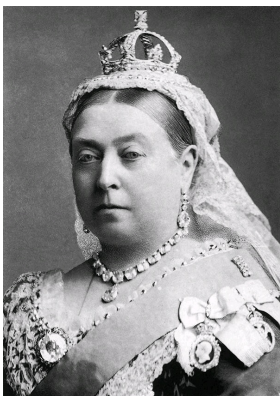
Queen Victoria photographed by Alexander Bassano in 1882.