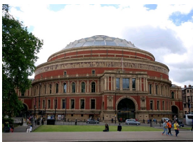
Royal Albert Hall of Arts and Sciences, South Kensington, London, 1867 - 1871.