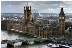
Palace of Westminster, London.