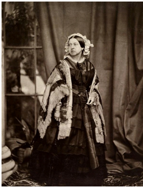
Queen Victoria 15 May 1860 Printed in carbon c.1889-91 by Hughes & Mullins Commissioned by Queen Victoria, Royal Collection.