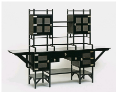
Edward Godwin, Japanese Cabinet, 1867 - 1870, Victoria and Albert Museum.