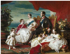
Franz-Xaver Winterhalter, The Royal Family in 1846, oil on canvas, 250,5x317,3cm, Royal Collections of H.M. Elizabeth II.