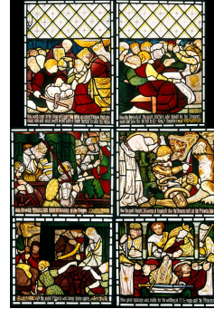
Stained-glass window representing the Saint George's legend, Dante Gabriel Rossetti for Morris, Marshall, Faulkner & Co., circa 1862, Victoria and Albert Museum.