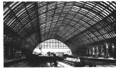
St Pancras station, London.