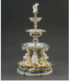
Victoria pierced centrepiece, Minton & Co., 1851.