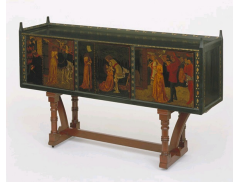
William Morris (peintre), Philip Speakman Webb (designer), Morris, Marshall, Faulkner & Co., Saint George Cabinet, 1861 - 1862, Victoria and Albert Museum.