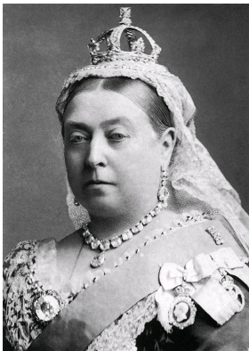
Queen Victoria photographed by Alexander Bassano in 1882.