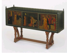
William Morris (peintre), Philip Speakman Webb (designer), Morris, Marshall, Faulkner & Co., Saint George Cabinet, 1861 - 1862, Victoria and Albert Museum.