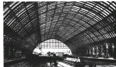
St Pancras station, London.