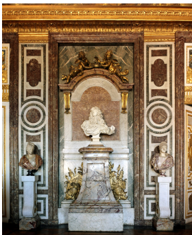
The base of the bust statue of Louis XIV made by Le Berlin out of Sarrancolin Ilhet marble.

Like Sarrancolin Fantastico marble, Sarrancolin Ilhet marble is extracted in the village of Sarrancolin, in the Hautes-Pyrénées department. The quarries were exploited extensively under the reign of Louis XIV, and from 1692 they were considered " royal quarries ". The Sarrancolin marbles feature all the red flame motifs but Sarrancolin Ilhet marble features grey-brown facies also.