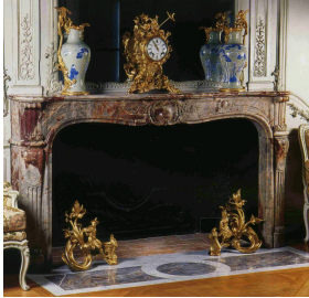
Superb antique Louis XV fireplace made out of Sarrancolin Ilhet marble decorating the Salon d'Abondant in the Louvre Museum.