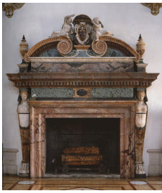
Exceptional fireplace found in the Hercules Room in Palazzo Farnese.