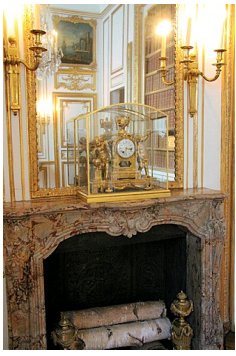
Louis XV fireplace made out of Sarrancolin Ilhet marble for the Cabinet of the Despatches in Versailles Palace.