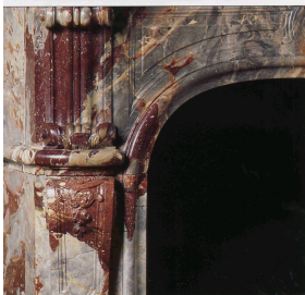
Detail found on the fireplace in the Salon d'Abondant in the Louvre Museum.