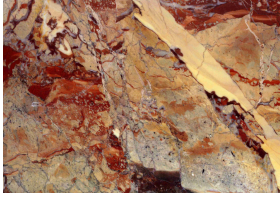
Sample of Sarrancolin Ilhet marble.