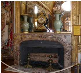
Large Regence fireplace made out of Sarrancolin Ilhet marble in the Oeil-de-Boeuf antechamber in Versailles Palace.