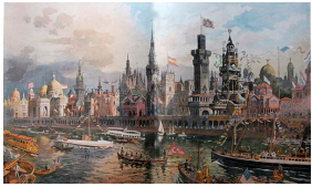
G. Garen, press illustration of the Seine.