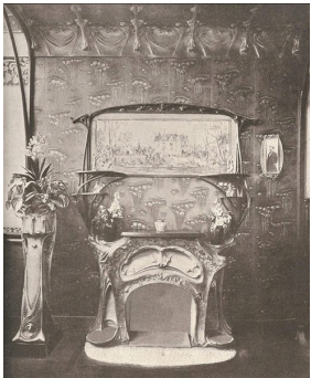
Fireplace from the Guimard stand, 1900, private coll.