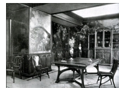
Eugene Gaillard, Dining Room, pavilion « L'Art Nouveau Bing ».

Finally, for the transport of visitors, the Decauville train is working, but also a mobile sidewalk , traveling on a viaduct seven meters from the ground.