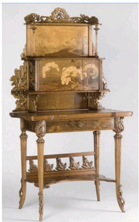
Emile Galle, Lady desk « Les Ombellules », 1900, Orsay Museum, Paris.