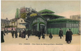
Aedicule for the « Bastille » subway station, by Hector Guimard, 1900, postcard, Musée historique environnement urbain.