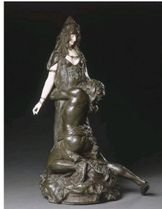
Theodore Riviere and Pierre Bingen, Salammbô at Matho's, 1895, Orsay Museum, Paris.