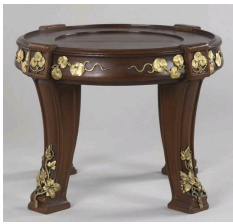
Perol Freres, stand, 1900, Orsay Museum, Paris.