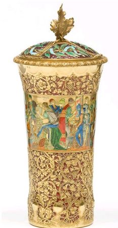
Lucien Falize and Olivier Merson, Les métiers d'art, 1895, Museum of Decorative Arts, Paris.