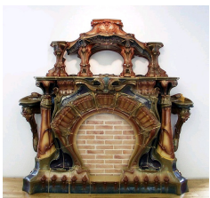
Stoneware fireplace of the