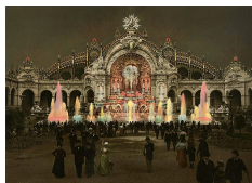
Illuminated water tower of the exhibition, 1900, postcard.

Organized on the theme of the "assessment of a century", the World's Fair of 1900 celebrates progress and the prospects of the future. It has remained iconic of the Paris of the Belle Époque , especially since Paris gained some masterpieces of its charm: the Grand Palais and the Petit Palais , which replace the Palais de l'Industrie in 1855, as well as the " Metropolitain " subway, inaugurated on July 14, 1900, the decoration of which is entrusted to Hector Guimard .