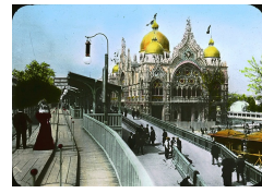
Joseph Hawke, colorized photo of the mobile sidewalk, The Brooklyn Museum, New-York.