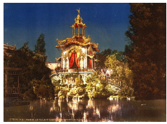
Luminous Palace of the Expo, 1900, postcard.