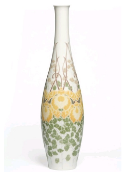
Vase of Argenteuil, Manufacture of Sévres, model by Henri Barberis and decoration by Henri Joseph Lasserre, 1900, Museum of Decorative Arts, Paris.