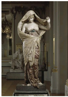
Ernest Barrias, Nature unveiling in 1899, Orsay Museum, Paris.

Sarreguemines factory, 1900, Museum of Sarreguemines.