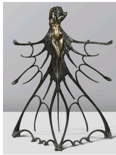
Rene Lalique, element of the stand Lalique's display, Lalique Museum Hakone, Japan