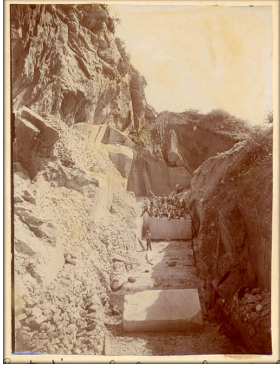
Old photograph of the Champied quarry in Pratz, Jura, where was extracted the Yellow Lamartine marble.