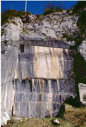
The Champied quarry in Pratz, Jura.