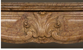
A Louis XV style fireplace in Yellow Lamartine marble. Galerie Marc Maison.