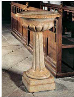
The font of the church of Moirans-en-Montagne in yellow Lamartine marble.