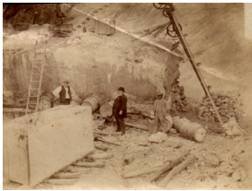
A quarry in Pratz in the early 20th century.