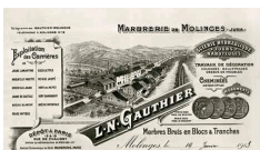
Company of Molinges marble works, old advertising.