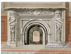
Canadian fireplace, illustrated in Charles Norton, Treasures of Art, Industry and Manufacture, 1876.