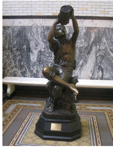
Bartholdi, Young Vine-Grower, 1876, Philadelphia, Drexel University.