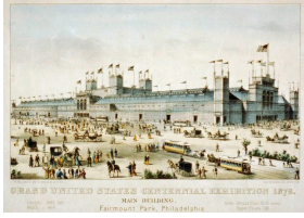
Main Exhibition Building of the 1876 World's Fair in Philadelphia, USA.