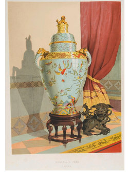
Chinese Vase illustrated in Charles Norton, Treasures of Art, Industry and Manufacture, 1876.