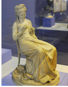
Jules Dalou, Embroider, 1876, Petit Palais, Paris.