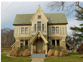
The Ohio House from the 1876 Centennial Exhibition in Philadelphia.

In the United States , the first official World's Fair was held in 1876 in Philadelphia for the centenary of the Declaration of Independence . It is called the Centennial Exhibition of Arts, Manufactures and Products of the soil and mine , and takes place in Fairmount Park, near the Schuylkill River.