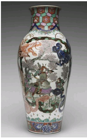
Fukagawa Yeizaemon, Vase presented in Philadelphia in 1876, Philadelphia Museum of Art.