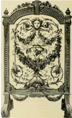
French firescreen illustrated in Earl Shinn, The masterpieces of the Centennial international exhibition of 1876.