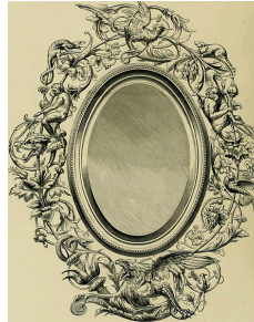
Mirror by Emile Philippe, illustrated in Earl Shinn, The masterpieces of the Centennial international exhibition of 1876.