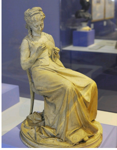
Jules Dalou, Embroider, 1876, Petit Palais, Paris.