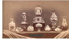
Exhibition of the Japanese ceramics, 1876 World's Fair in Philadelphia.