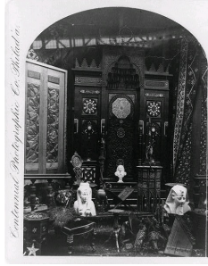
Egyptian display, photograph from 1876, Library of Congress, Washington.