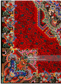
"Smyrna" Carpet illustrated in Charles Norton, Treasures of Art, Industry and Manufacture, 1876.