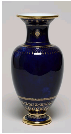
Manufacture royale de porcelaine de Sèvres, Vase Lancelle without handle, rich decoration, 1829, gold and hard-paste porcelain, Cité de la céramique, Sèvres.