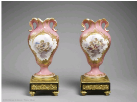
Manufacture royale de porcelaine de Sèvres, Pair of vases "with ears" with pink background, 1758, Soft-paste porcelain, gilt bronze, Musée du Louvre.