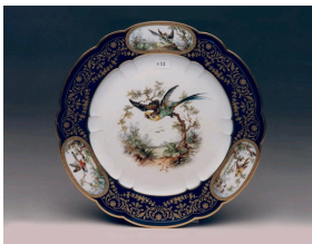
Manufacture royale de porcelaine de Sèvres, Decor with birds, Duplessis flat plate, 1758, hard-paste porcelain, Cité de la céramique, Sèvres.