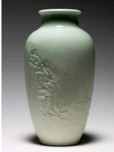
Manufacture de Sèvres, Saigon Vase, « Limbo and sirens », Auguste Rodin and Albert Ernest Carrier-Belleuse, circa 1888, edition of 1934, Hard-paste porcelain, Musée Rodin, Paris.