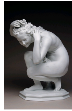
Jean-Baptiste Carpeaux (1827-1875), Flora squatting, 1870, Bisque porcelain, Cité de la céramique, Sèvres.