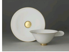
Jacques Emile Ruhlmann (1879 - 1933), Cup and saucer, Ruhlmann, circa 1930, white and gold decor, circa 2000, Cité de la céramique, Sèvres.