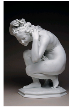
Jean-Baptiste Carpeaux (1827-1875), Flora squatting, 1870, Bisque porcelain, Cité de la céramique, Sèvres.