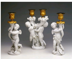
Manufacture royale de porcelaine de Sèvres, Children candlesticks, after François Boucher, circa 1773, biscuit, Cité de la céramique, Sèvres.

The Sèvres - Cité de la céramique (City of Ceramics), also known as the Manufacture nationale de Sèvres and formerly Manufacture de Vincennes , is probably one of the most principal European porcelain manufactories as it has contributed to the evolution of porcelain since 1740.