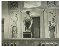
Engraving of the Museum of ceramics.