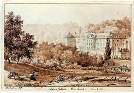
Achille Etna Michallon (1796-1822), Manufacture de Sèvres (1817), Paris, Bibliothèque nationale de France.