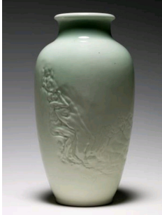
Manufacture de Sèvres, Saigon Vase, « Limbo and sirens », Auguste Rodin and Albert Ernest Carrier-Belleuse, circa 1888, edition of 1934, Hard-paste porcelain, Musée Rodin, Paris.