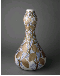
Manufacture de Sèvres, Vase des Pommerets "pins", 1903, porcelain, Petit Palais, Paris.