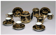
Manufacture royale de porcelaine de Sèvres, Service Litron with three golds decor on black covered, Hard-paste porcelain, developed at the Manufacture de Sèvres around 1770, Cité de la céramique, Sèvres.