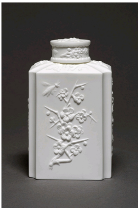
Manufacture de Vincennes, Tea Box of India, 1753, biscuit, enameled inside, soft-paste porcelain, Cité de la céramique, Sèvres.