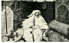
The writer Pierre Loti (1850-1923)