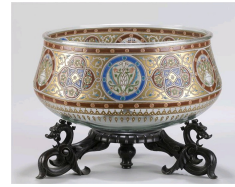
Joseph Brocard (1831-1896), Bowl, 1871, Blown glass, gold and enamel decoration, original base in blackened wood, Musée d'Orsay, Paris.