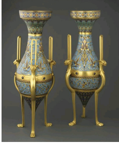
Maison Barbedienne, Constant Sévin, Pair of ornamental vases, copper, gilt bronze and champlevé enamel, Musée d'Orsay, Paris.