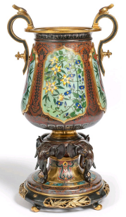
Christoffe & Cie. « Elephant » Vase, ca. 1878, Patinated and inlaid bronze, cloisonné enamel, Les Arts Décoratifs, Paris.