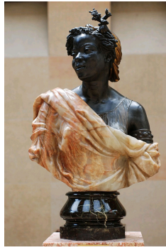
Charles Cordier (1827-1905), Capresse, 1861, bronze and onyx, Musée d'Orsay, Paris.