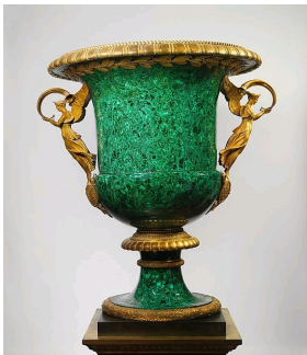
Pierre-Philippe Thomire, Demidoff Vase, 1819, Metropolitan Museum of Arts, New-York.