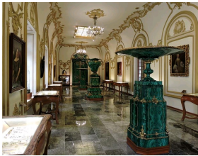
Malachite Room of Chapultepec Castle, 1775, Mexico.

Circa 1860, this is probably what motivated Mme de Païva , of Russian origin, to insert a malachite veneer on the fireplace of her room in her famous Parisian mansion.