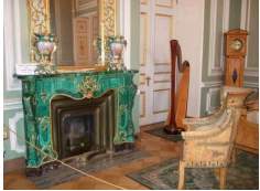
Fireplace of the Youssouпов Palace, circa 1860, Saint-Petersburg.