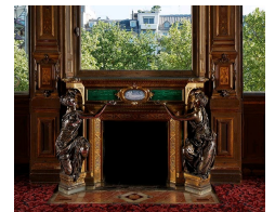
Malachite plated fireplace of the Païva Hotel, 1856-1866, Paris.