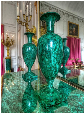
Ornamental vases of the Malachite Room of Trianon, 1808, Versailles Palace.