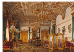
Konstantin Andreyevich Ukhtomsky, The Malachite Room of the Winter Palace, 1865, watercolour, Hermitage Museum, Saint-Petersburg.