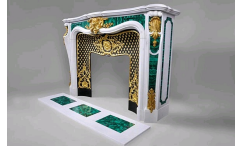
« Paiva » Fireplace in white Carrara marble and malachite, Maison&Maison.