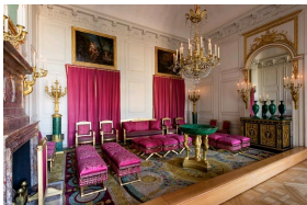
Malachite Room of Trianon, 1808-1809, Versailles Palace.