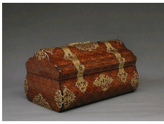
Box, circa 1860, Metropolitan Museum of Arts, New York.