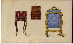
Mounted box and firescreen, Giroux Album, Museum of Decorative Arts, Paris.