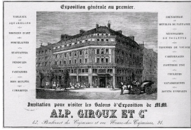
Invitation of Alphonse Giroux and Co, 1857-1867.