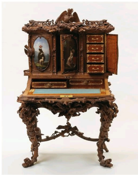
Cabinet of Empress Eugenie made by Alphonse Giroux, presented at the 1855 World's Fair, Compiègne Palace.