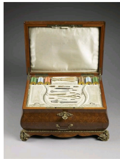
Sewing kit, Compiègne Palace.