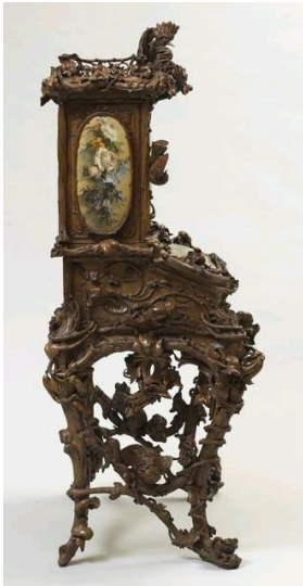
Cabinet of Empress Eugenie, presented at the 1855 World's Fair, Compiègne Palace.