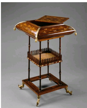
« Working » table bu Alphonse Giroux, circa 1835, Louvre Museum, Paris.

Alphonse Giroux , " the merchant of the princes ", is an important Parisian manufacturer of luxury furniture and accessories, whose products were intended for an aristocratic and bourgeois clientele, installed as early as 1799 at No. 7, rue du Coq Saint -Honoré, then Boulevard des Capucines. Founded by François-Simon-Alphonse Giroux under the name " A. GIROUX in PARIS ", it was taken over by the Giroux children and remained active under the name of " Alphonse Giroux et Cie " until 1867, when the direction is taken over by Ferdinand Duvinage .