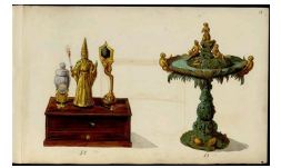
Project of toy and fountain, Giroux Album, Museum of Decorative Arts, Paris.