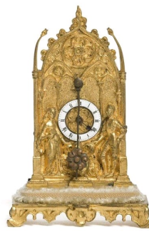
Troubadour Clock, 1835-1850, Museum of Decorative Arts, Paris.