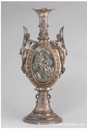
Christofle, Vase « L'Education d'Achille », sculptures de Mathurin Moreau, 1867, Paris, Musée d'Orsay.