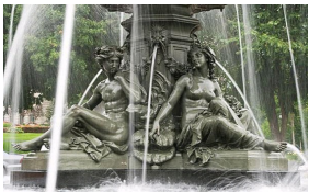
Fountain of Tourny, Gold Medal of the 1855 World Fair, Parliament of Quebec.