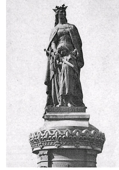
Marguerite of Anjou, Salon of 1902.