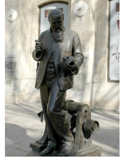
Zenobe Gramme, electrician, 1902, Paris, Musée des Arts et Métiers.