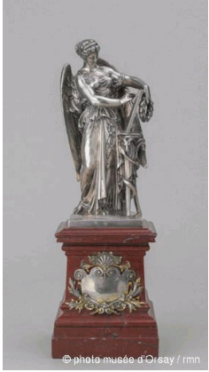
Model by Mathurin Moreau for Christofle, « Renown engraving the date of the 1866 Exhibition on a golden tablet », Paris, Orsay Museum.