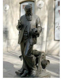
Zenobe Gramme, electrician, 1902, Paris, Musée des Arts et Métiers.