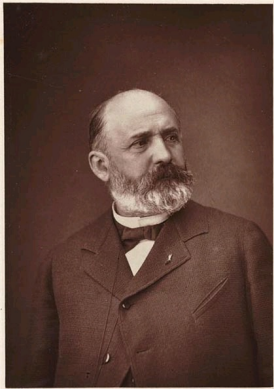
Mathurin Moreau photographed circa 1892.