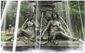
Fountain of Tourny, Gold Medal of the 1855 World Fair, Parliament of Quebec.