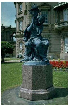
The Winter, given to Queen Victoria in 1855, Osborne House, The Royal Collection, London.