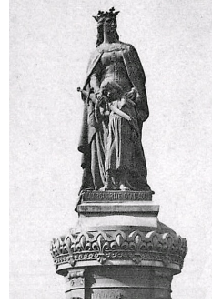
Marguerite of Anjou, Salon of 1902.