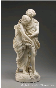
Daphnis and Chloe, Paris, Orsay Museum.