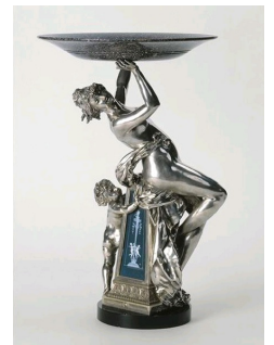
Cup, sculptures by Carrier-Belleuse, chiseling by Marioton, enamel by Doat, 1886, Paris, Orsay Museum