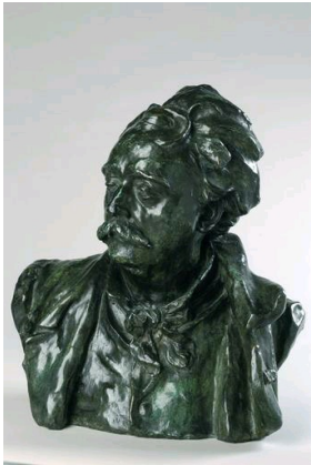
Auguste Rodin, Bust of Carrier-Belleuse, 1882, Paris, Rodin Museum.