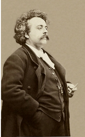
Etienne Carjat, portrait of Albert-Ernest Carrier-Belleuse, Paris, National Library.