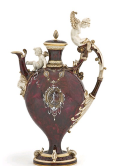
Buire de Blois, Sevres Manufacturing, design by Carrier-Belleuse, sculpture by Auguste Rodin and Jules Roger, Paris, Museum of Decorative Arts.