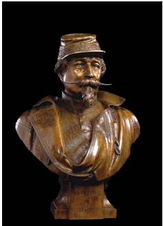
Carrier-Belleuse, Napoleon III in Italy, 1859, Museum of Saint-Germain-en-Laye.