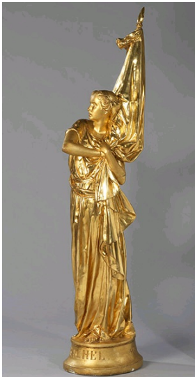
Carrier-Belleuse, Mademoiselle Rachel singing the Marseillaise, 1848, Walewski Collection.

Albert-Ernest Carrier de Belleuse as known as Carrier-Belleuse (1824 - 1887) is the most prolific sculptor of the Second Empire , who touched all areas of sculpture, from porcelain of Sevres to monumental sculpture of marble, by way of a large production of terracotta and bronze statuettes.