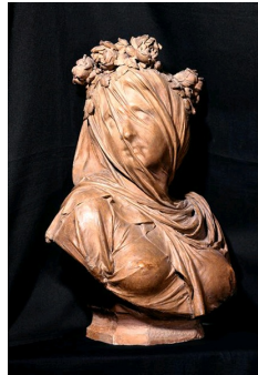
Carrier-Belleuse, Veiled Vestal, 1859, Museum of Art and Archaeology of Laon.