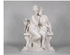
Carrier-Belleuse, The Secret, 1872-1874, Marc Maison Gallery.