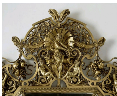
Monumental mirror by the Barbedienne Foundry for the World's Fair of 1867 (cast from 1878), sculpted characters by Carrier-Belleuse, Paris, Orsay Museum