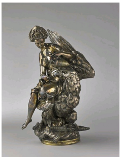
Carrier-Belleuse, Hebe and Jupiter's Eagle, 1858, Paris, Orsay Museum.