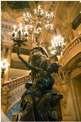
Carrier-Belleuse, Torches of the Opera in the Palais Garnier, Paris.