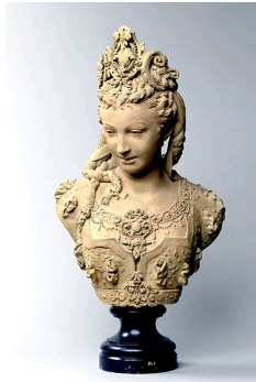
Carrier-Belleuse, Bust of a woman wearing a diadem, 1860-1870, Paris, Orsay Museum.