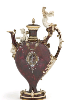
Buire de Blois, Sevres Manufactory, design by Carrier-Belleuse, sculpture by Auguste Rodin and Jules Roger, Paris, Museum of Decorative Arts.