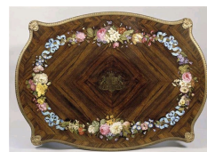
Tahan Manufactory, Louis XV