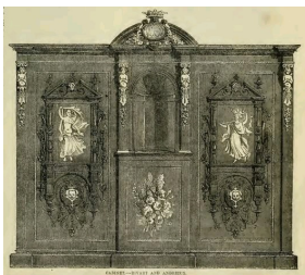
Cabinet of the Duke Caumont de la Force, acquired after the 1851 World's Fair. The Crystal Palace and its contents, Clark, 1852, p. 245.