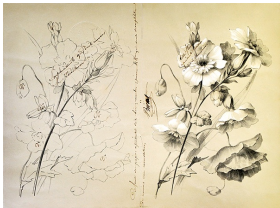
Sketch accompanying the addition certificate from December 29th, 1849, INPI, Paris.