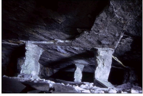
Saint Anne quarry, close to Dinant in Wallonia, Belgium. The walls have been cut with a longwall mining.

Black marbles grouped under the name Belgium Black marbles refers to several types of black marbles, such as the Black Mazy , the Black Dinant , Black Theux marble or the Black Golzinne .