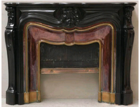
Belgium Black marble three shell design from the 19th century.