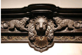
Detail of a Belgium Black marble fireplace from the 19th century. Exceptionnal craftsmanship in the sculpting work of the lion head and the fox cubs that emerge

In the 19th century , these fine and deep black marbles, were used in the production of fireplaces and clocks. In this category, the Mazy Black and Dinant Black marbles were most commonly used. Unfortunately it is very difficult, without the help of a scientific analysis, to know from which quarries this marbles comes. Generally, the Dinant Black used for the production of clocks or manufacture of fine sculptures. Meanwhile, Mazy Black was used for fireplaces tiles, baseboards, shelves, vertical coverings, steps, fine sculptures and mantels .