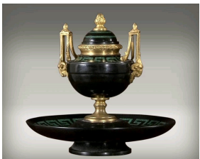
TAHAN: Malachite and Belgium Black marble Inkwell.