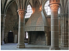
Fireplace in the Knight's Room, Mont Saint-Michel, France, 15th century.