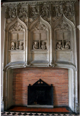
Fireplace in the Hôtel Jacques Coeur, France, Bourges city, c. 1451.