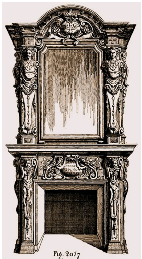
Louis XIII style fireplace, by Crispin de Passe, 1642. Illustration from J. Justin Storck, Le Dictionnaire Pratique de Menuiserie, Ebénisterie, Charpente, 1900.

Decorating the top of the fireplace, the overmantel mirror (also called "Pierglass" ) can be made of stone or sculpted wood , frame a mirror , a painting , or combine these several elements. Set where used to be chimney breasts and fireplace hoods, the overmantel has been a major concern of designers since 18th century. Never neglected, it reflects each period, and transforms at the whim of styles.