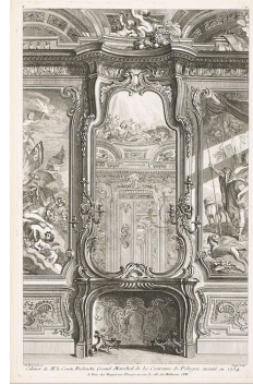
Juste-Aurèle Meissonnier, drawing of a fireplace and its overmantel mirror, 1734, Louvre museum.