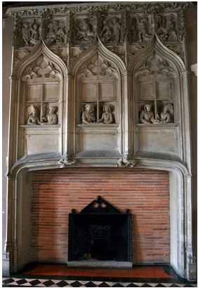
Fireplace in the Hôtel Jacques Coeur, France, Bourges city, c. 1451.