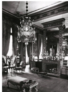
Coco Chanel's Paris apartment designed by Maison Jansen in the 1930s