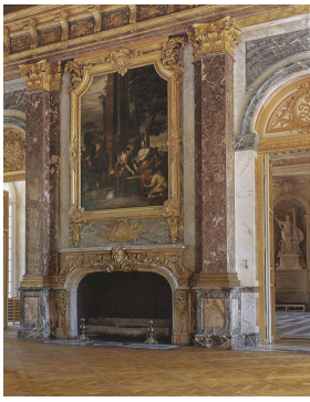
The Hercules Salon, Palace of Versailles, 1729-1736.