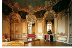
The Princess of Rohan's room, Hôtel de Soubise in Paris, designed by Germain Boffrand, 1732.