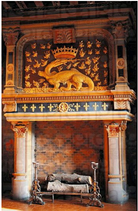
Francis I of France's ceremonial fireplace, mid 16th century. Counsel Room, Castle of Blois, France.