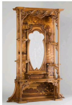
Émile Gallé, Overmantel with mirror, Orsay museum, inv. OAO1468