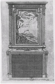
Louis XIV style sculpted overmantel and overmantel mirror, in the Fireplace book by Jean Marot, 1660.