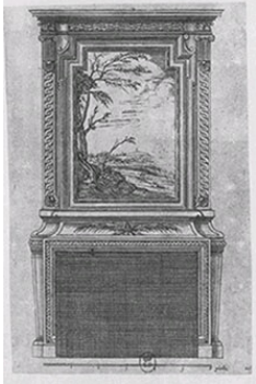
Louis XIV style sculpted overmantel and overmantel mirror, in the Fireplace book by Jean Marot, 1660.