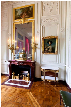
The Queen's Bathroom in Petit Trianon, Palace of Versailles.