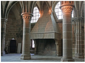
Fireplace in the Knight's Room, Mont Saint-Michel, France, 15th century.