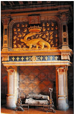
Francis I of France's ceremonial fireplace, mid 16th century. Counsel Room, Castle of Blois, France.