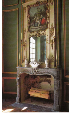
Castle of Morsan, Louis XV style overmantel with a mirror and a genre painting.