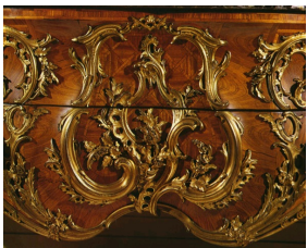
Louis XV bedchamber's commode, Versailles Palace, 1739. Bronzes are signed by Caffieri. At the king's death, the commode was inherited by the Duc d'Aumont. Wallace Collection, London.