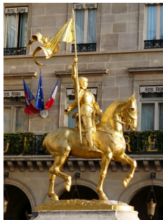
Emmanuel Frémiet, Equestrian statue of Joan of Arc, Place des Pyramides, Paris, 1874.