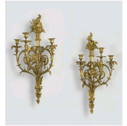
Lucien-François Feuchère, Pair of three-light sconces, 1788, from Marie Antoinette's dressing room. Louvre Museum, Paris.