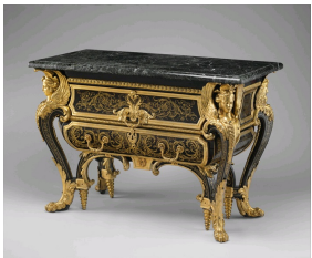
André Charles Boulle, Commode, circa 1710-1720. MET Museum, NY, USA.