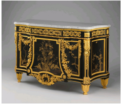
Jean-Henri Riesener, Marie-Antoinette's commode, 1783. Collection of Mrs. William Kissam Vanderbilt (1853-1933) the MET Museum, NY, USA.