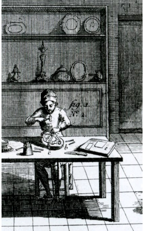
A chiseler-gilder. (Encyclopédie, Planches, T. I, « Argenteur », pl. I, fig. 1, n°2).

Crafting an object out of gilt bronze demands a considerable amount of work and the participation of several workers and different trades. Firstly, a sculptor creates a mock-up of the object out of terracotta or wood , following a drawing or model. Then, after printing a mold of the mock-up, the smelter-chiseler smelts the bronze by casting the molten metal into the mold. The chiseling is very important to the value of a bronze piece. At this step, the smelter-chiseler must render the model, slightly affected by the smelting, as closely as possible. This aspect of his trade is close to that of a sculptor, and only the best artisans are allowed to complete this step.