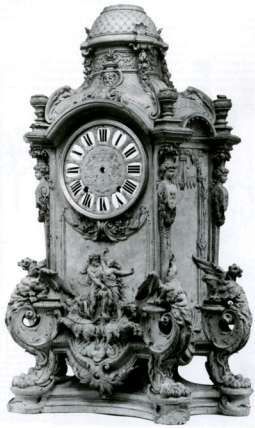
Terracotta mock-up of a clock, circa 1700. Presenting the details of the reliefs to take impressions for molding and casting. Getty Museum, Malibu, USA.

Authenticating a gilt-bronze piece is always a delicate matter. There have been many replicas and frequent re-gilding from the 18th century to today. Unlike with other techniques, touch does not intervene much in identifying gilt bronzes. Experience and an eye for detail are more useful. Several factors can help; for example, French gilt bronzes from the 18th century are generally lighter and less thick than those from the 19th century.