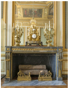
Pierre gouthière, Fireplace in the Salon des Nobles de la Reine, Versailles Palace, 1785.