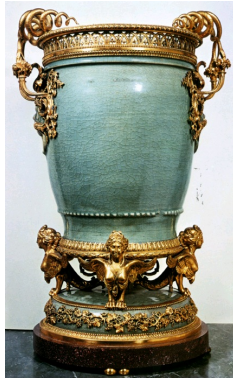
Antique celadon vase from Japan with gilt bronze frame by Gouthière, 1782. Duc d'Aumont's order. This vase was bought by Louis XVI for the Museum. Louvre Museum, Paris.