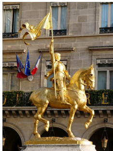
Emmanuel Frémiet, Equestrian statue of Joan of Arc, Place des Pyramides, Paris, 1874.