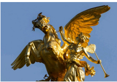
Gilt bronze statues from the Alexandre III bridge, World's Fair of 1900.