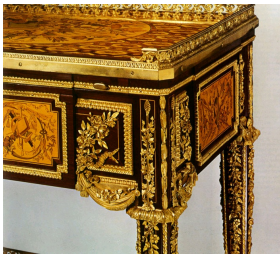
Jean-Henri Riesener, Writing table for Marie-Antoinette, 1782. Petit-Trianon and Riesener stamps. Bronzes were gilt by Remond. Rothschild de Waddesdon collection, Waddesdon Manor, England.