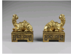
Pair of andirons with lying camel, circa 1785, coming from the Turkish Boudoir of Marie-Antoinette. Louvre Museum, Paris.