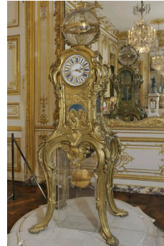
Louis Dauthiau, Siméon Passemant, Philippe Caffieri the Young and Jacques Caffieri - Astronomical Clock of Louis XV, Cabinet of the pendulum, Versailles Palace, 1753.