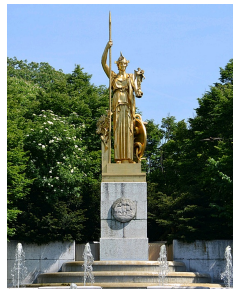
Léon-Ernest Drivier, Monumental statue of Athena (about 10 meters high) made for the colonial exhibition of 1931. Fountain of the Porte Dorée in Paris.