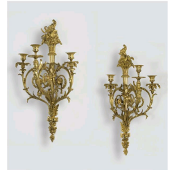
Lucien-François Feuchère, Pair of three-light sconces, 1788, from Marie Antoinette's dressing room. Louvre Museum, Paris.