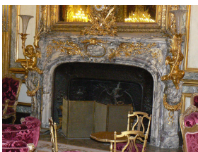
Exceptional fireplace made out of Fleur