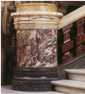
Base of column made out of Fleur de Pêcher marble making up the large staircase in the opera house in Paris (Palais Garnier).