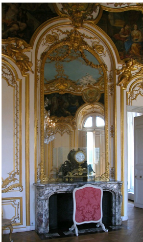
Large Regence style fireplace decorating the oval room in the Soubise hotel in Paris.