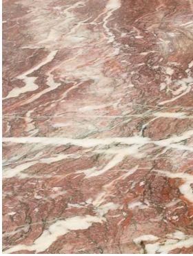
Sample of Fleur de Pêcher marble

Fleur de Pêcher marble is a historic marble, used a lot during the 19 th century to make exceptional works of art. For example the extraordinary fireplace in main hall of the Napoleon III apartments at the Louvre museum , decorated with babies in bronze that catch the light.