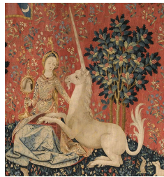
Picture 14 : The Lady and the Unicorn, Sight, between 1484 and 1538. Flanders, Cluny Museum, Paris.