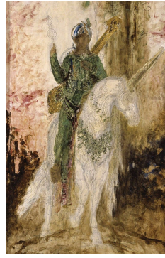
Picture 9 : Gustave MOREAU (1826-1898), Persian Poet