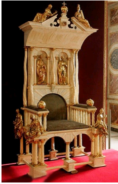
Picture 7 : "Unicorn Throne" of the Kings of Denmark, 1671. Teeth & narwhal tusks of walrus.