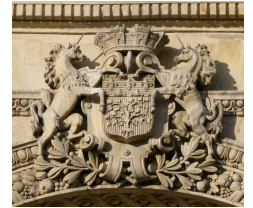
Picture 11 : Coat of arms of the City of Amiens, frontage of the Picardie Museum in Amiens, France.