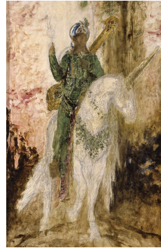
Picture 9 : Gustave MOREAU (1826-1898), Persian Poet