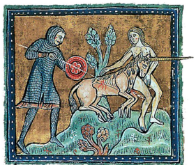
Picture 5 : "Hunting the Unicorn" Illustration extracted from the Illuminated Rochester Bestiary, 1230.

The word "unicorn" dates back to the early thirteenth century, from the Old French unicorne , which derives from the Late Latin unicornus , the noun form of the adjective unicornis which was used to designate a creature with one horn. Many myths and legends developed around this creature, and it also influenced many artists.