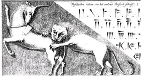
Picture 1 : Unicorn in the ruins of Persepolis. Carstens Niebuhr (1733-1815), Voyage to Arabia and other circumjacent country, engraving, Amsterdam, 1779.