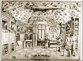
Picture 2 : The cabinet of curiosities of the Neapolitan pharmacist & naturalist Ferrante Imperato (1550-1625) in 1672. Engraving, Library Estense, Modena.