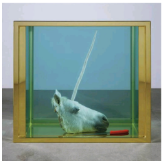
Picture 12 : Damien Hirst, Broken Dream , 2008. Contemporary art plays with chimeras and the come back of taxidermy in the 21th century.