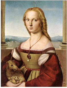
Picture 6 : Raphael (1483-1520), The Lady and the Unicorn, 1505-1506, Galleria Borghese, Rome (Italy).

This animal was therefore represented on all heraldic elements: war and parade objects such as flags and military equipment, as well as elements related to the lords' residences like sculpted low-relief architecture, fireplaces, and iron firebacks.