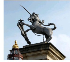
Picture 10 : Unicorn statue at Hampton Court, England. It is facing the Lion on the other column.