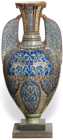
Théodore Deck (1823 - 1891), Alhambra vase, 1878, Decorative arts Museum, Paris.