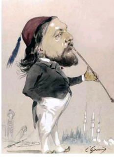
Eugène Giraud, Théophile Gautier Smoking His Chibouk, 1862, watercolor, BnF, Paris.