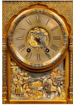
Escalier de Cristal (Att. to), Hunt Scenes Bronze mantle garniture in the Indian style patinated in three colors (Ref #03208).