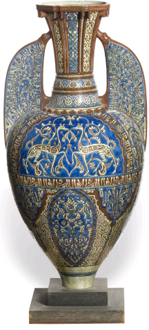
Théodore Deck (1823 - 1891), Alhambra vase, 1878, Decorative arts Museum, Paris.