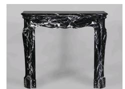
Picture n°11 : Small antique Pompadour Louis XV style fireplace in Black Marquina marble.