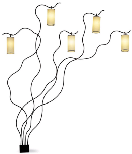
Jean Royère (1902-1981), Luminaire "Liane" (vine), about 1950-1955, metal tube, original Rhodoïd lampshade