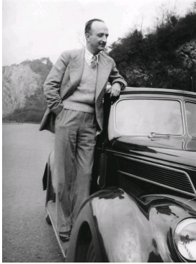
Jean Royère (1902-1981)