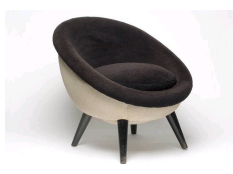
Jean Royère (1902-1981), Chair