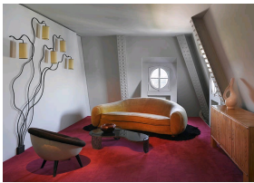
Jean Royère (1902-1981), Period room, lamp "Liane", sofa "Boule", chair "Œuf" and cupboard in straw marquetry.

Jean Royère (July 3, 1902 - 14 May 1981) was from a privileged social class and lived a pleasant childhood in the french capital. He started to worked at Le Havre in the import and export business from its 24 to its 29 years. This profession guarantee him a good lifestyle. However, this young man left this comfortable career and choose a more risky path : the designer career, field in which he was a passionate and talented artist.