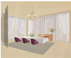
Jean Royère (1902-1981), Projet for a dinningroom, drawing