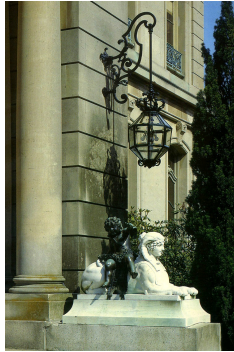
Picture n°14 : Entrance to The Elms with a lantern on a bracket and sculptures of a sphinx and a putto.