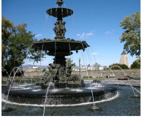
The large fountain of Tourny in Quebec made by the Val d'Osne by Mathurin Moreau in 1854.