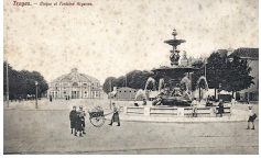
The Troyes fountain in the Champagne region made by the Val d'Osne foundry.