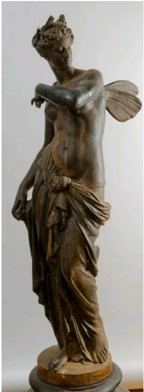
Made by Val d'Osne foundry by Mathurin Moreau.