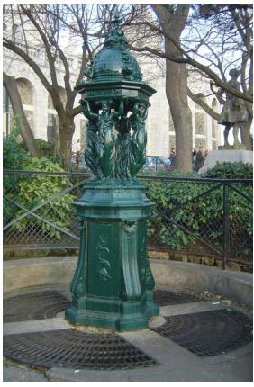
Wallace fountain decorating a square in Montmartre, in Paris.