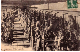
The Val d'Osne art foundry, model gallery.