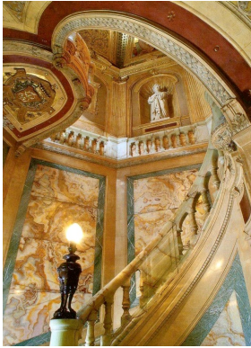
The staircase made out of onyx in the Hotel de Paiva in Paris.