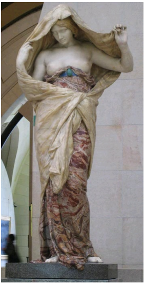
Sculpture by Barrias, Orsay Museum, Paris.