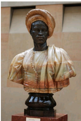
Sculpture by Charles Cordier.