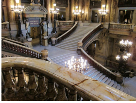
The handrail of the staircase made out of onyx in the Opera house in Paris.

There are several types of Onyx marbles , but the most well known and the most widely used one comes from Algeria.