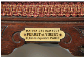
Plate put on a furniture on which we can read Maison des Bambous.

In 1900 Perret and Vibert once again exhibited their work at the Universal Exhibition of Paris, under the category of “luxury and cheap furniture”. They were rewarded with a silver medal for their “high quality lacquered and marquetry furniture”.