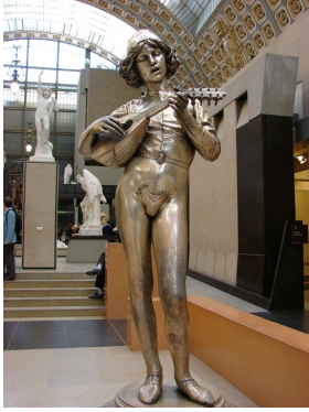
Silvered bronze edition, by the Barbedienne Foundry, of Paul Dubois's Fifteenth-Century Florentine Singer, 1865. Orsay Museum, Paris.