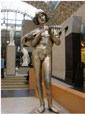
Silvered bronze edition, by the Barbedienne Foundry, of Paul Dubois's Fifteenth-Century Florentine Singer, 1865. Orsay Museum, Paris.