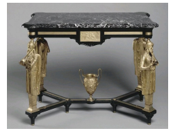
Neo-Greek table by Emile Hebert and the Barbedienne Foundry, c. 1878. Orsay Museum, Paris.