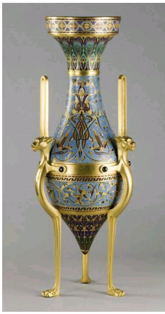
Decoration vase, model by Constant Sévin for the Barbedienne Foundry, brass, gilded bronze and chased enamel, 1862. Orsay Museum, Paris.