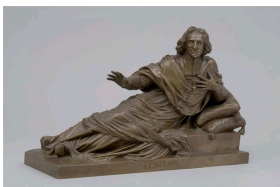
Reduction by Barbedienne of David d'Angers' Monument to Fenelon, erected in 1826 in Cambrai. Louvre Museum, Paris.

The Barbedienne Foundry is a famous 19th century bronze foundry, whose statues and art objects became rapidly very renowned. This bronze studio co-worked with other trades, and put his name to a great variety of works, such as furnishing in particular. Attending every World's Fair of its time, the Barbedienne Foundry was regularly awarded, notably at the World's Fair of 1855 where it was awarded the Great Medal of Honor.