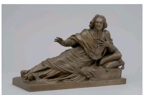
Reduction by Barbedienne of David d'Angers' Monument to Fenelon, erected in 1826 in Cambrai. Louvre Museum, Paris.

The Barbedienne Foundry is a famous 19th century bronze foundry, whose statues and art objects became rapidly very renowned. This bronze studio co-worked with other trades, and put his name to a great variety of works, such as furnishing in particular. Attending every World's Fair of its time, the Barbedienne Foundry was regularly awarded, notably at the World's Fair of 1855 where it was awarded the Great Medal of Honor.