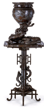
Important Japanese-inspired bronze garden furniture, after a sketch by Edouard Lièvre, realized by the Barbedienne Foundry, c. 1880. Museum of Decorative Arts, Paris.