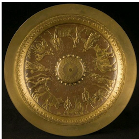
Neo-Greek cup of bronze by Ferdinand Levillain and the Barbedienne Foundry, c. 1879. Orsay Museum, Paris.