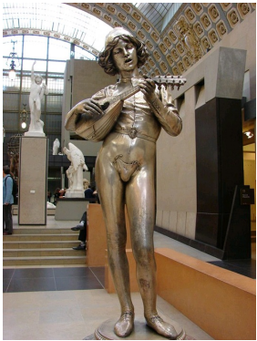
Silvered bronze edition, by the Barbedienne Foundry, of Paul Dubois's Fifteenth-Century Florentine Singer, 1865. Orsay Museum, Paris.