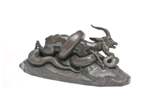
Antoine-Louis Barye, Python wrapping around a gazelle, model from c. 1841, smelted by the Barbedienne Foundry between 1876 and 1889. Bronze with green patina, Museum of Decorative Arts, Paris.