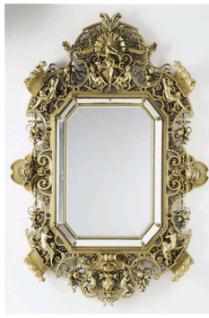
Monumental Mirror by Constant Sévin, realized by the Barbedienne Foundry in 1878. Orsay Museum, Paris.