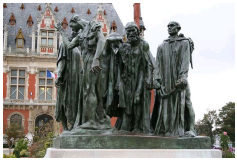
Auguste Rodin, The Burglers of Calais, smelted by Leblanc-Barbedienne in 1889 and inaugurated in Calais in 1895.