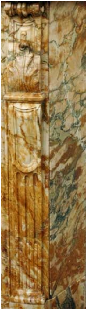
Detail of a Breche from Benou