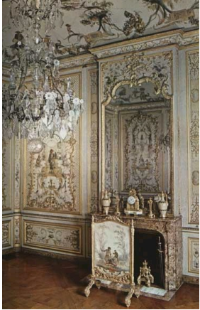
Chateau of Chantilly, Breche d'Alep mantel, XVIIIe