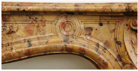
Detail of a Breche from Alep