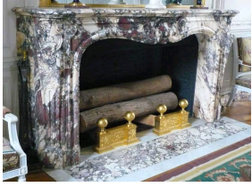
Grand Trianon in Versailles, mantel from the Emperor's family living room