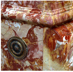
Detail of a Breche from Saint-Maximin