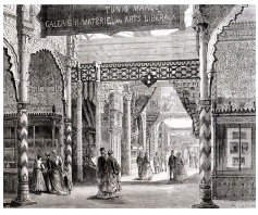
Pavilion of Tunisia and Morocco.