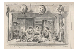
Interior of Governor Satzouma's house, illustration from the Monde Illustré, 1867.