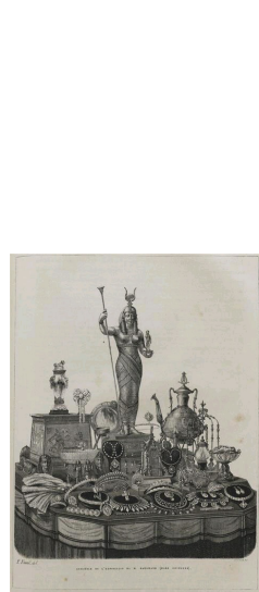
Exhibition of the goldsmith Baugrand, "The Wonders of the World's Fair", press illustration, 1867.

The World's Fair of 1867 took place during a period of social and labour struggle. Taking place during a period of contestation in the working world, this exhibition is considered preponderant for three reasons. Firstly it is considered a great retrospective of the history of work. Secondly it was an exhibition that featured products hoping to improve both the physical and moral conditions of the population at the time. Finally it was an exhibition that saw the arrival of labour delegations at the expense of the state. These connections were incorporated in the founding texts of the French trade unionism, and some were enforced in legislation. In a sort of utopia, the state attempted to portray the Universal Exhibition as guarantor of the worker's well-being in social harmony. The nationalist hyperbole of the preceding Universal Exhibitions thus replaced the worry of dispute among the workforce. This reversal of values was a means of appeasing the anger and revolt deep within, which unfolded, the year after, in the Revolution of 1868 .