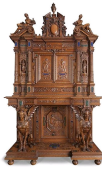
Henri-Auguste Fourdinois, Two story Cabinet, Grand Prix of the World's Fair of 1867, Museum of Decorative Arts, Paris.