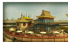
China's Pavilion, reconstitution.