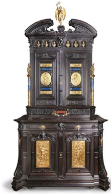
Antoine Kneib, Jules Dalou, Cabinet, Silver medal of the Exhibition, 1867, Museum of Decorative Arts, Paris.