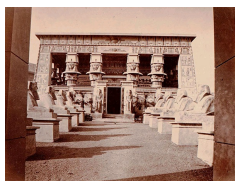
Athor Temple, photo by Pierre Petit, National Archives.

Achieving even more wonders than the previous ones, the World's Fair of 1867 , organized by Napoleon III in Paris , is one of the most important World's Fairs. To bring together 32 countries and their colonies, Napoleon III innovates to "make it more universal than the previous ones" , notably by organizing it with national Pavilions, which will remain the formula of the future exhibitions.