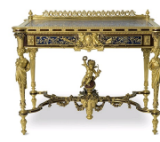
Christofle et Cie, sculptures by Carrier-Belleuse and Joseph Cheret, Toilet Table of Gustave Pereire, 1867, Museum of Decorative Arts, Paris.