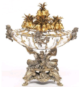
Froment-Meurice, François Carlier, Cup of the table center piece ordered by Napoleon III, 1867, Museum of Decorative Arts, Paris.