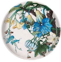
Théodore Deck and Eléonore Escallier, 1867, Museum of Decorative Arts, Paris.