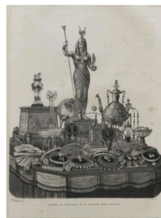
Exhibition of the goldsmith Baugrand, "The Wonders of the World's Fair", press illustration, 1867, RMN.