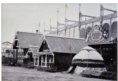
Russian Isbas in the Exhibition's park, photograph from 1867.