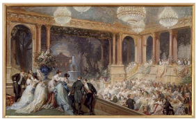
Antoine Baron, Official bal at the Palais des Tuileries during the World's Fair of 1867, 1867, Compiègne Palace.