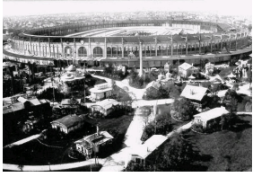
View on the Palais Omnibus and the park, World's Fair of 1867, Paris.