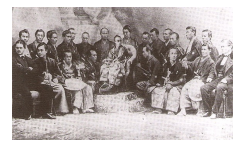
The Japanese delegation around Tokugawa-Akitake, illustration from the Monde Illustré, 1867.