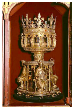
Viollet-le-Duc, Reliquary Sainte-Couronne d'Épine, presented at the World's Fair of 1862, Treasure of Notre-Dame Cathedral, Paris.