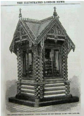
Russian Izba at the World's Fair of 1862, The Illustrated London News, 1862.