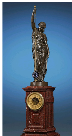
Carrier-Belleuse, statue of