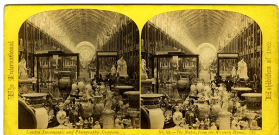
Stereoscopic view of the Nave, from the Western dome. London Stereoscopic and Photographic Company, 1862.