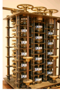
Analytical Engine by Charles Babbage, Arithmeum, Bonn, Germany.