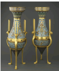
Ferdinand Barbedienne and Constant Sévin, pair of vases exhibited at the World's Fair of 1862, Orsay Museum, Paris.