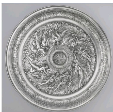
Elinkgton et Cie, design by Leonard Morel-Ladeuil, Plate "Table of the Dreams", silver galvanoplasty, model presented at the World's Fair of 1862, Orsay Museum, Paris.