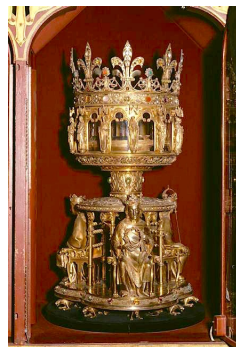
Viollet-le-Duc, Reliquary Sainte-Couronne d'Epine, presented at the World's Fair of 1862, Treasure of Notre-Dame Cathedral, Paris.