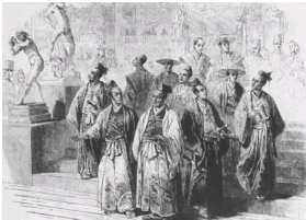
Japanese delegation at the World's Fair of 1862.