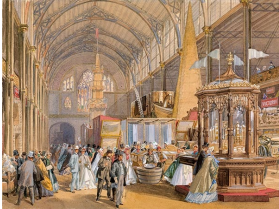
Joseph Nash, The Nave of the London Great Exhibition of 1862, watercolour, 1863. State Library of Victoria's Pictures collection.