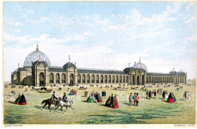
The Great Exhibition of 1862, watercolour, 1862.