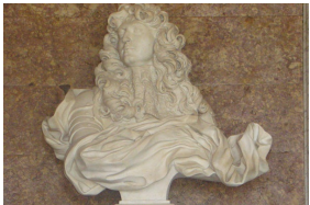
Bust of Louis XIV by Le Bernin